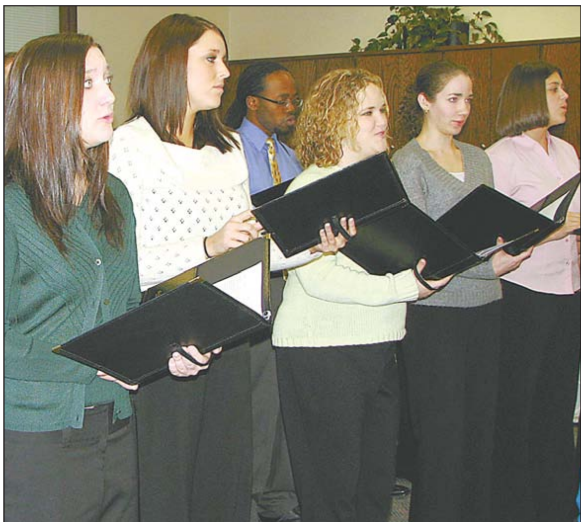
Ledge photo / SCOTT POWELL

"It hasn't happened in recent years," she said.